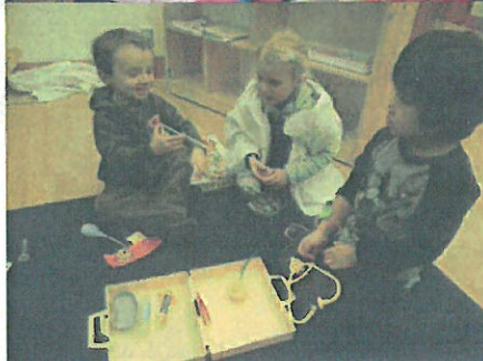
The doctors are in!