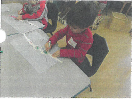
More Activities ...