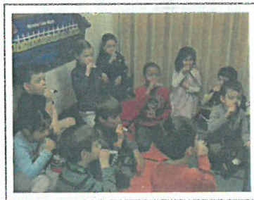
Friends try to control the amount of air they blow into the paper party horn.